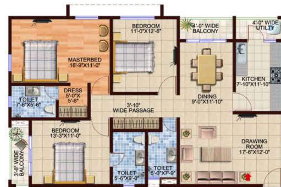
3 BHK Unit 1640 sq.ft.