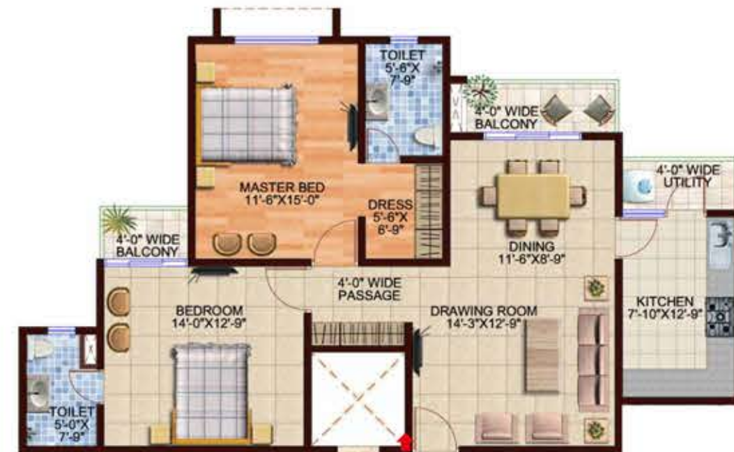
2 BHK Unit 1325 sq.ft.