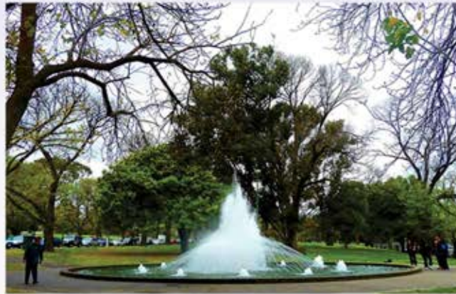
Fountain at Road Junction

The township has been developed as per the authority (L.D.A.) bylaws and advance ecofriendly techniques. Security systems are indispensable so the township is enclosed by boundary wall and a gate with guardroom. Fire hydrants has been installed as a critical piece of any emergency response system used to preserve lives and property. We also facilitate within our township to undertake rainwater conservation initiatives by providing Rainwater harvesting system.