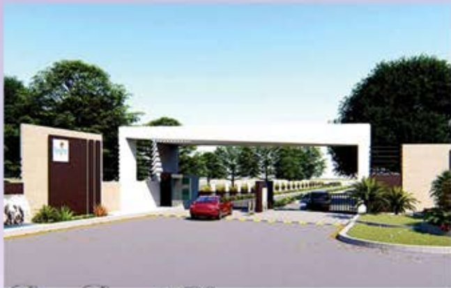
Gate Guard Room