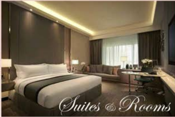
Suites & Rooms