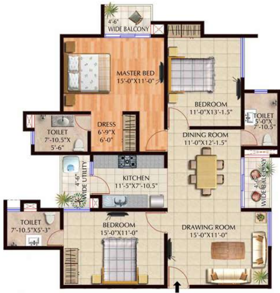
5 | 3BHK Unit 1502 Sq. Ft.