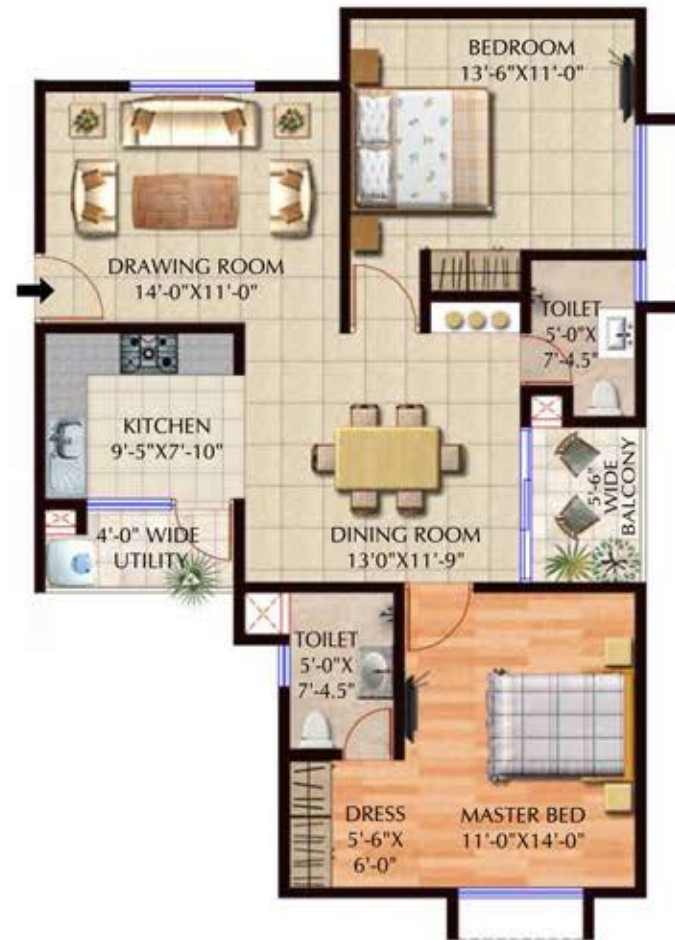
4 | 2BHK Unit 1177 Sq. Ft.