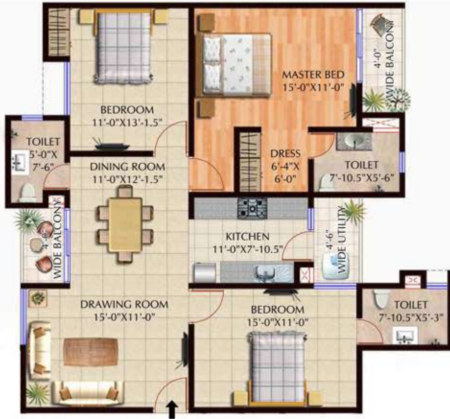
7 | 3BHK Unit 1502 Sq. Ft.