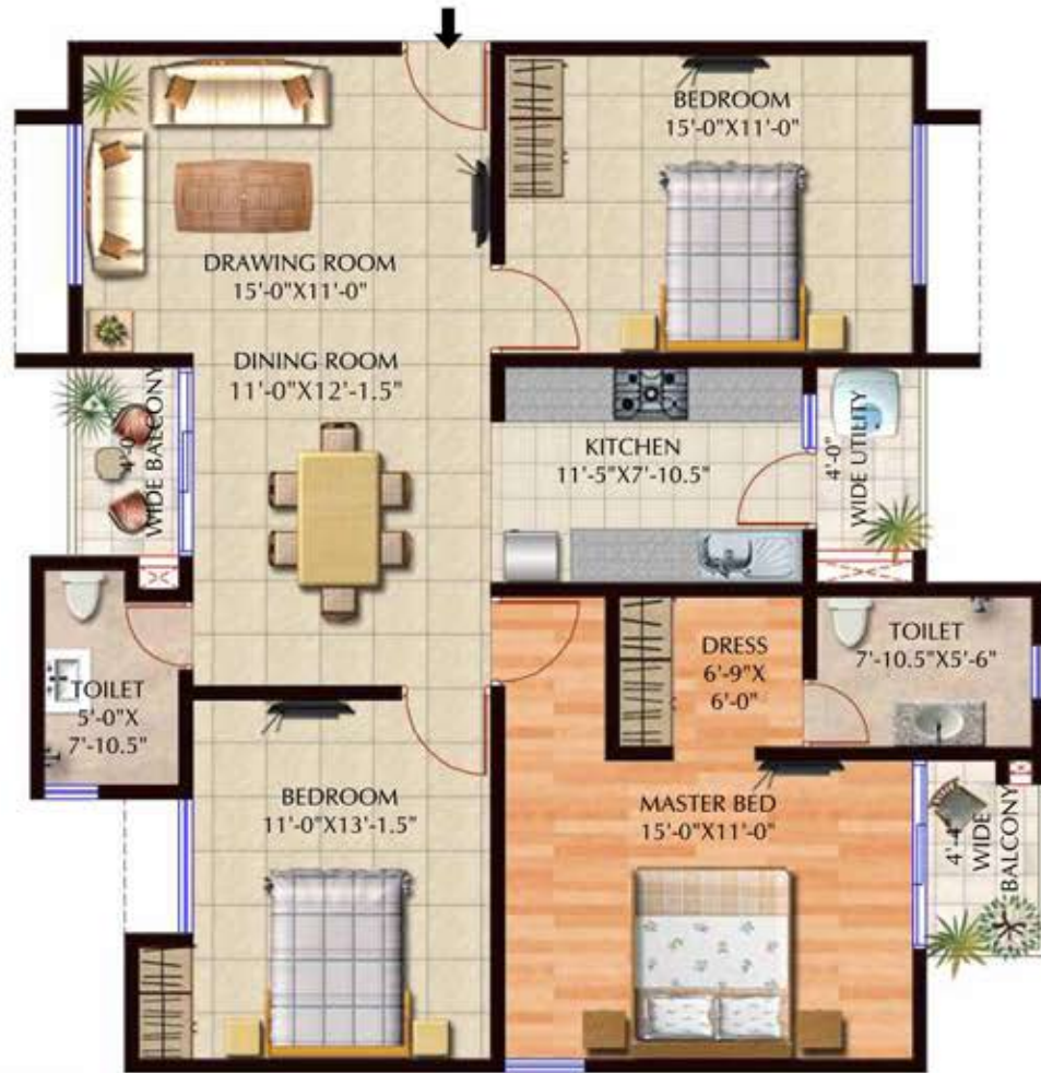
1 | 3BHK Unit 1450 Sq. Ft.