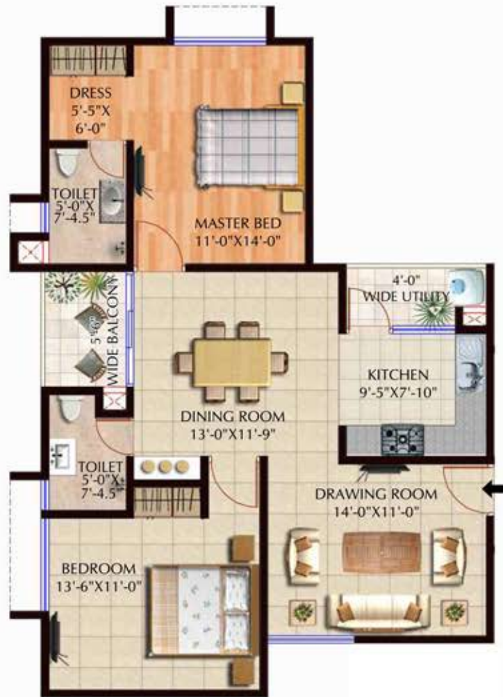
9 | 2BHK Unit 1177 Sq. Ft.