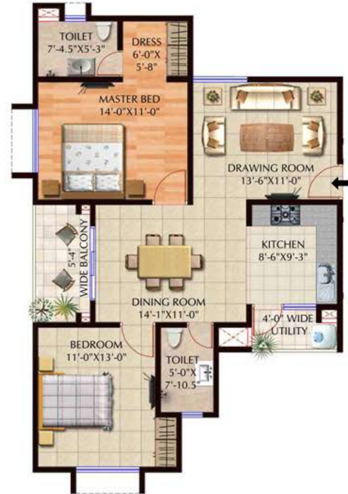
2 | 2BHK Unit 1186 Sq. Ft.