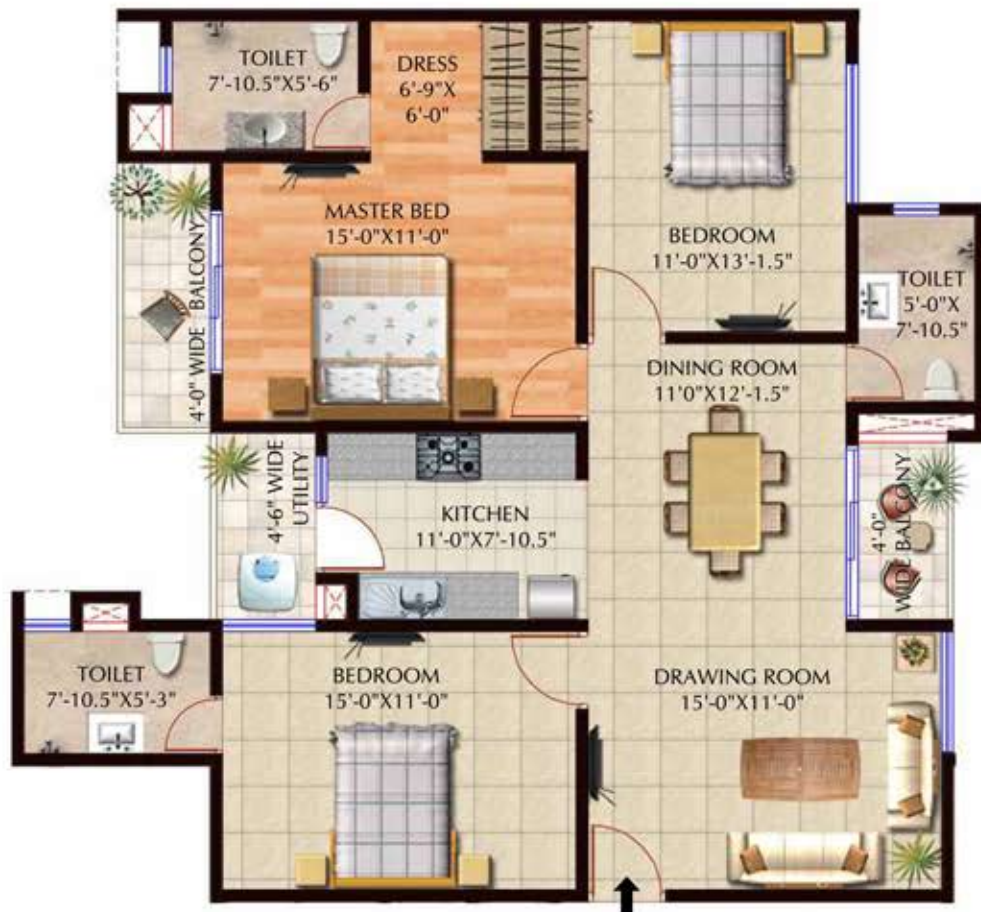
3 | 3BHK Unit 1502 Sq. Ft.