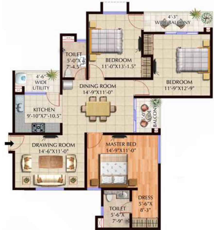
10 | 3BHK Unit 1531 Sq. Ft.