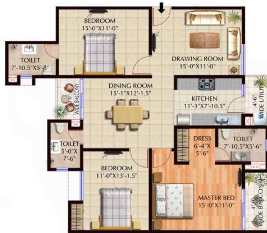
8 | 3BHK Unit 1502 Sq. Ft.