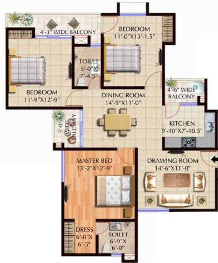
12 | 3BHK Unit 1517 Sq. Ft.