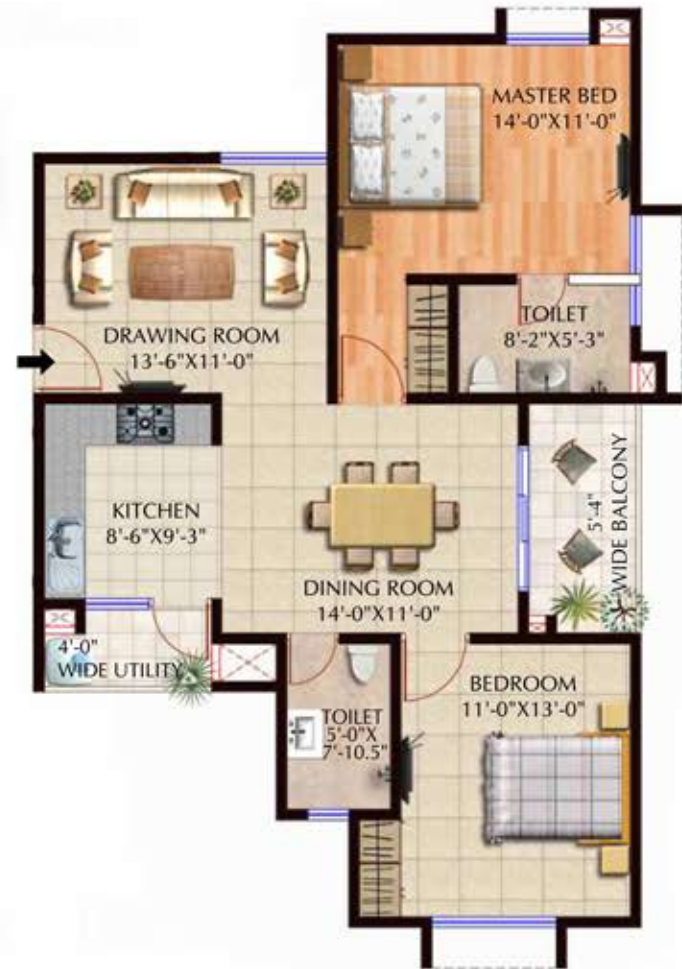
6 | 2BHK Unit 1186 Sq. Ft.