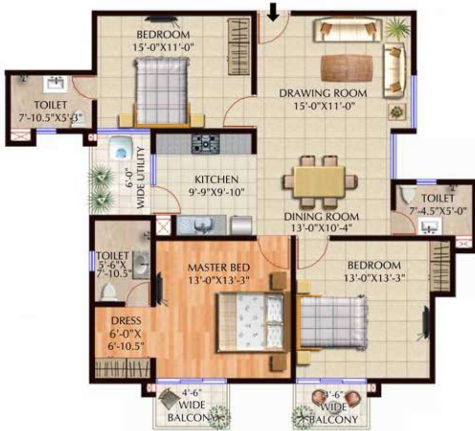
11 | 3BHK Unit 1569 Sq. Ft.